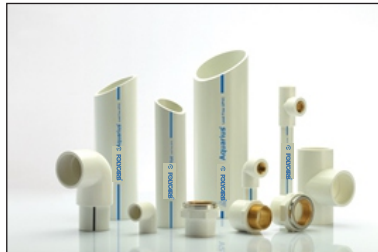
UPVC PIPES & FITTINGS