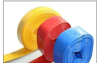
LD LAPETA KRISHI PIPE